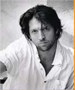
Alexander Tressor Steps, New York

BROADWAY DANCE Saturday, October 24 12:30 - 3pm $35. advance $38. at the door